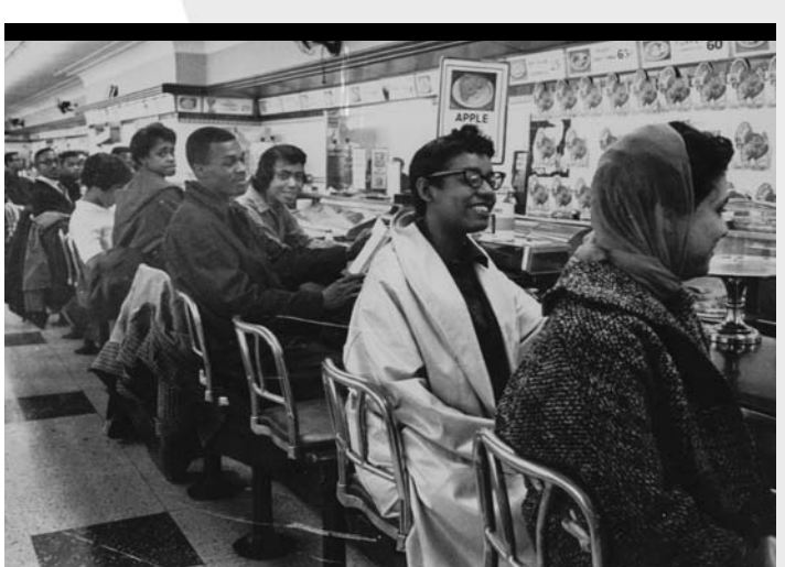
Sit-in at a Nashville lunch counter, 1960. Students held sit-ins in "whites only" restaurants where they demanded service for both blacks and whites at lunch counters.