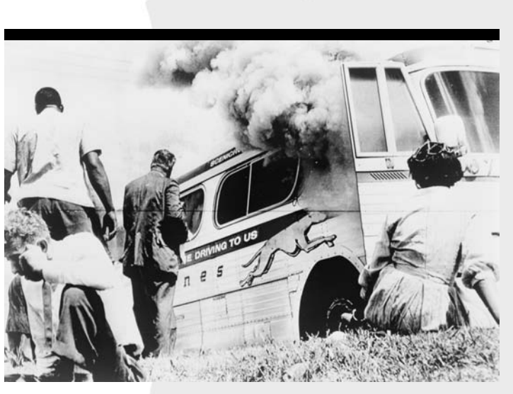
Freedom Riders gather near a burning bus in Anniston, Alabama. Members of CORE and SNCC, in interracial groups, rode buses across the South to protest noncompliance with the Supreme Court ruling banning segregated interstate travel.